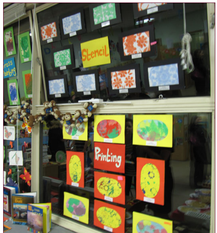
Saplings Day Nursery Exhibition