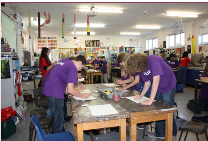
Art: A Risky Business