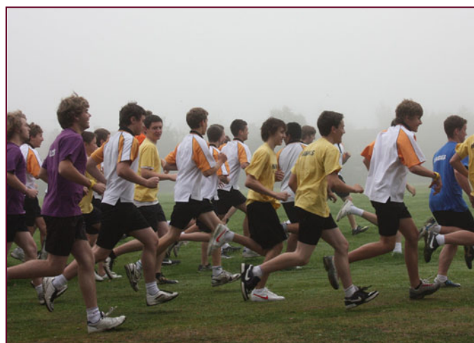
Year 11 Fitness for Life Race