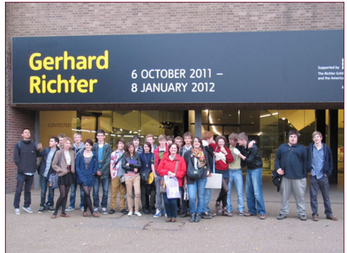
Year 12 and 13 Art and Photography Students

Spanning nearly five decades, and coinciding with the artist's 80th birthday, Gerhard Richter: Panorama is a major retrospective exhibition that groups together significant moments of his