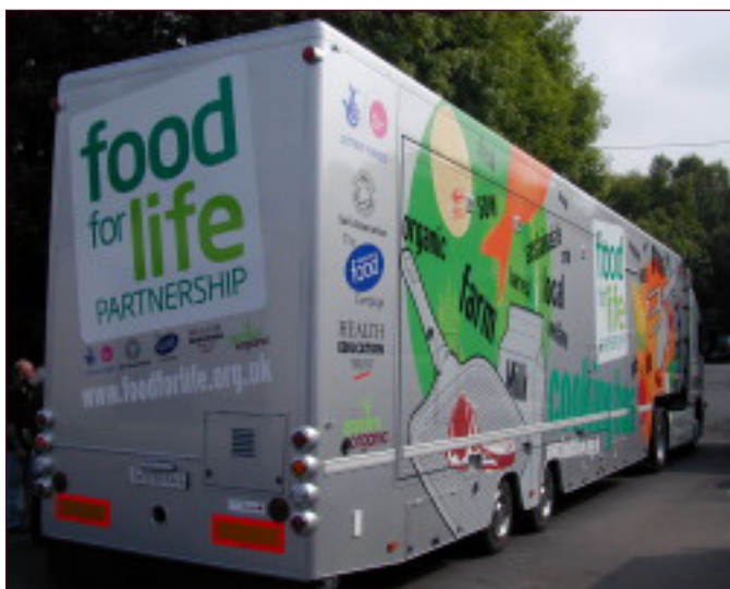
The Cooking Bus