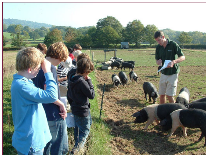
Year 7 Farm Visit