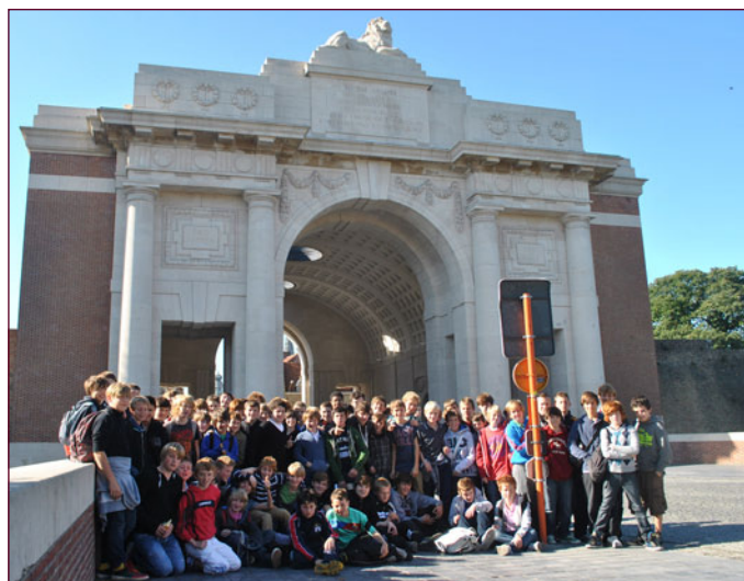
Year 9 at the Menin Gate