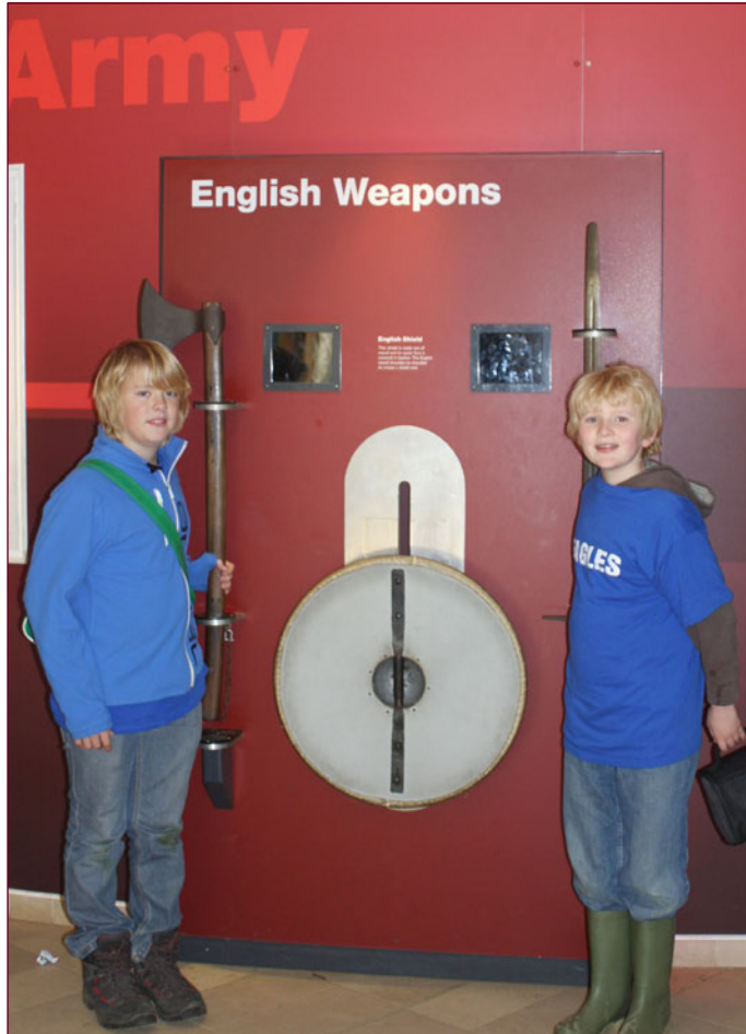
Year 7 at Battle Abbey