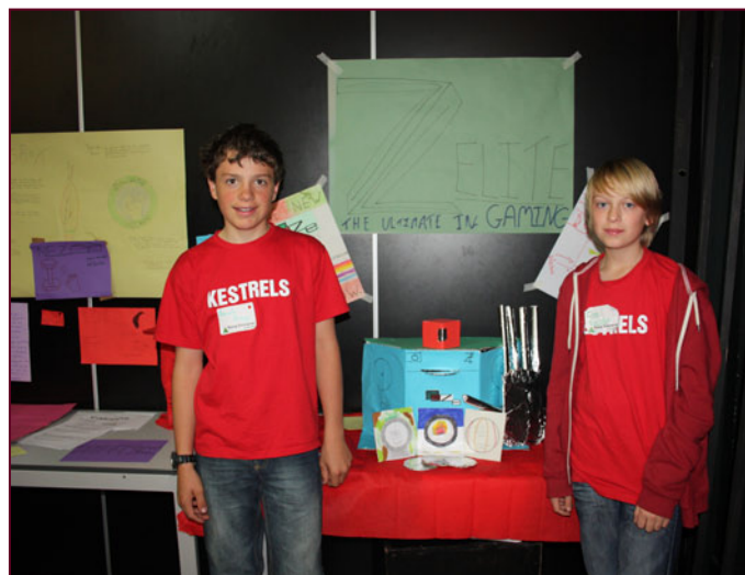
Sell for Success