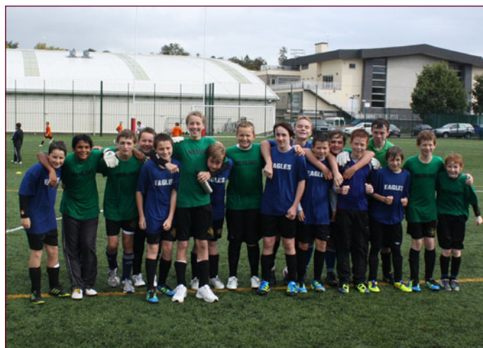
Year 9 Inter House Football