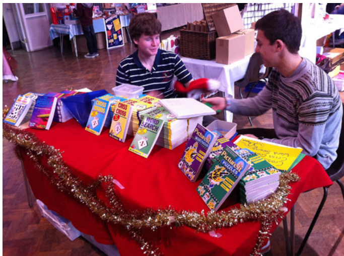
TWGSB Young Enterprise at the Christmas Fayre

Please give your support to Young Enterprise companies at your local fairs throughout the year.